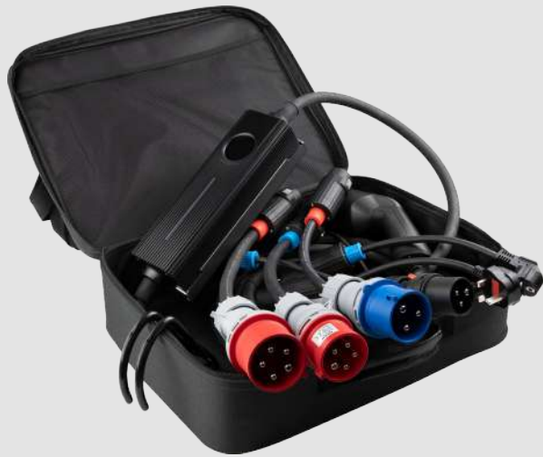
BS-PCD050 Three phase smart charger